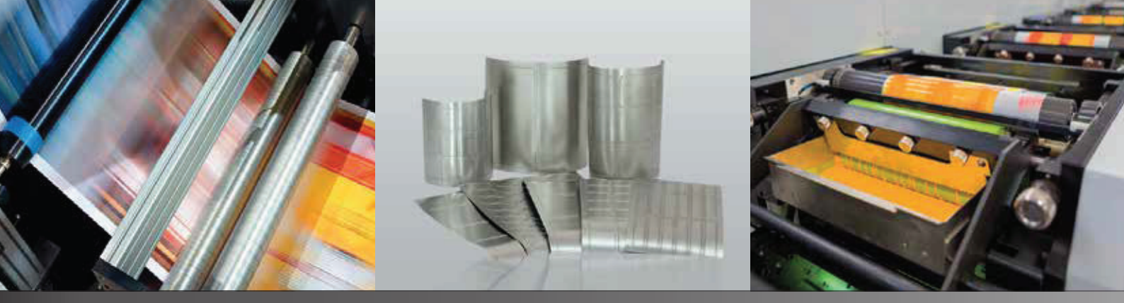
We are a manufacturing company specializing in label production.